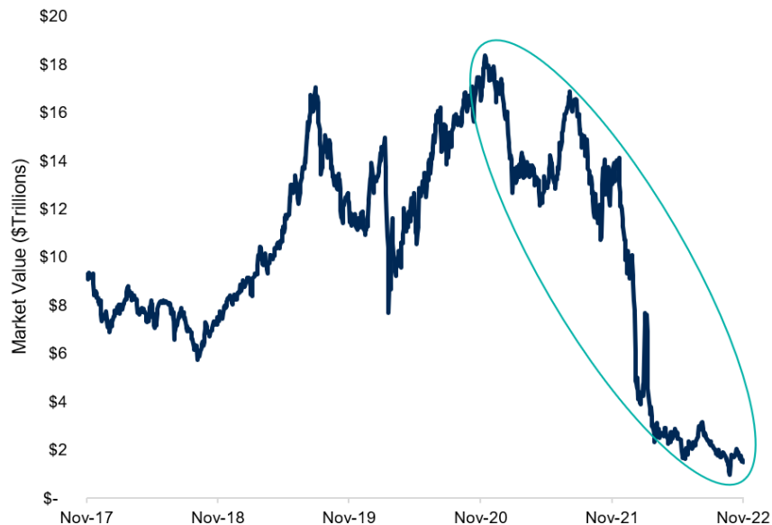
Bloomberg Global Agg Negative Yielding Debt Market Value