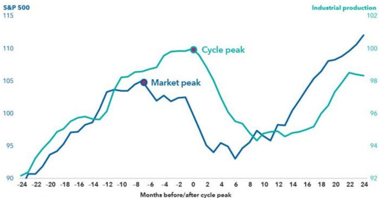
Average S&P 500 Return vs Industrial Production

There is a saying in market research, “analysis of averages leads to average analysis”. It appears many forecasters entering 2023 fell prey to this approach and based on historical recession data proclaimed with great confidence that 2023 was a recession year. However, no such recession has materialized, and the clock is running out in 2023. Our view remains the same as how we entered the year. The likelihood of a recession occurring in the foreseeable future is rising based on a growing body of forward-looking economic data showing the potential for slower future growth.